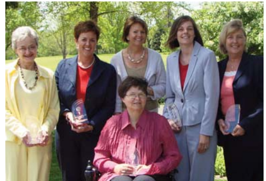
Women of Achievement award winners