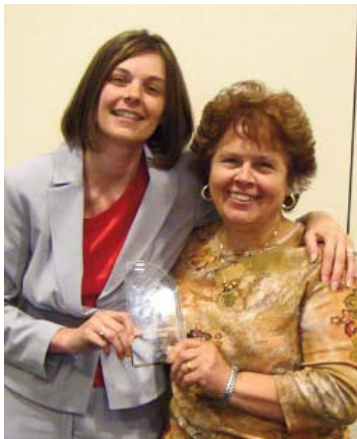
More WOA award winners