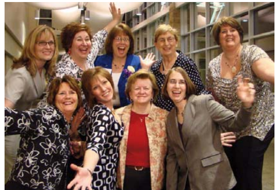
The team who pulled it all together.