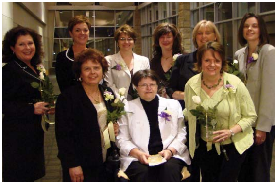
WOA Award Winners